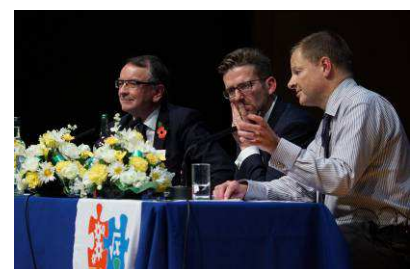
Question and Answer session